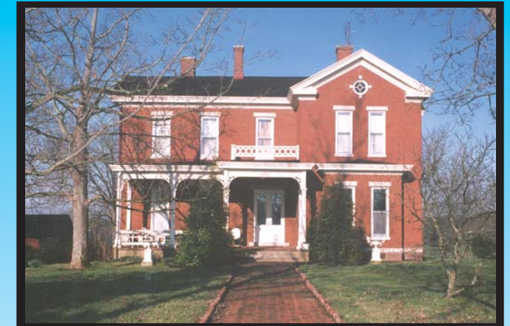
Alcorn Homestead - Stanford

45 miles south of Lexington 32 miles north of Somerset 25 miles west of I-75 - Mt. Vernon